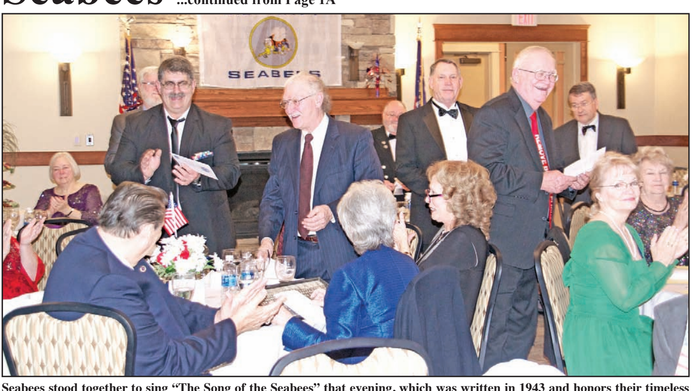
Seabees stood together to sing "The Song of the Seabees" that evening, which was written in 1943 and honors their timeless

showing the true comradery of veterans in the Southeast.