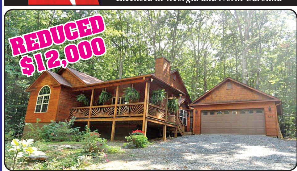
BEAUTIFUL CABIN IN THE WOODS , in the desired Trackrock Area of the Northeast GA Mountain Town of Blairsville. 2,642 Sq Ft w/3 BR/2.5 Baths. Convenient to Young Harris College & Hiawassee, as well. Lge sunroom, lge deck, fireplace, wood floors, eat-in kitchen, garage, stor. bldg. All on 2.34 Acres. Asking only $217,900 . MLS #262158